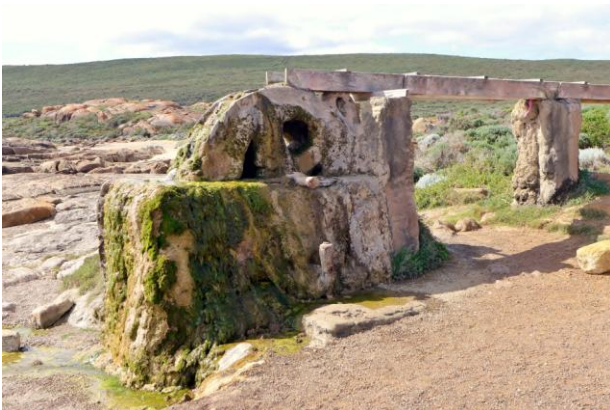
Water wheel turned to stone in Cape Leeuwin, Australia.